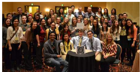
Pitt Students at PPA Mid-Year